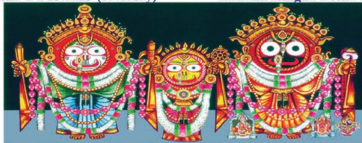
Rajadhiraj (Suna Besha) Dt. 27.11.23 (Monday)