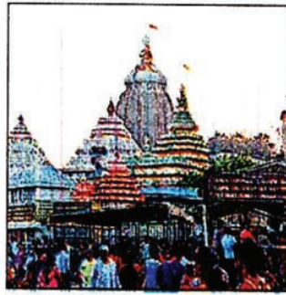
The Jagannath Temple in Puri

"Though we have not introduced any dress code, we want devotees to wear very decent and unobjectionable clothes in the place of worship. Temple is neither a park nor a beach. From January 1, we plan to stop devotees who are found wearing distasteful