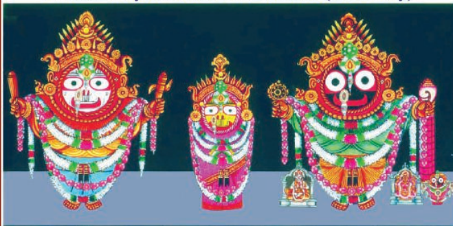
Dalikia / Tribikram Besha Dt. 25.11.23 (Saturday)