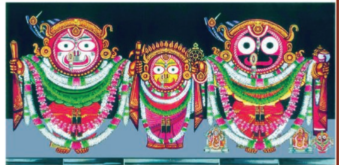
Bankachuda Besha Dt. 24.11.23 (Friday)