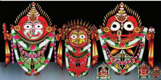
Laxminarayan Besha Dt. 23.11.23 (Thursday)