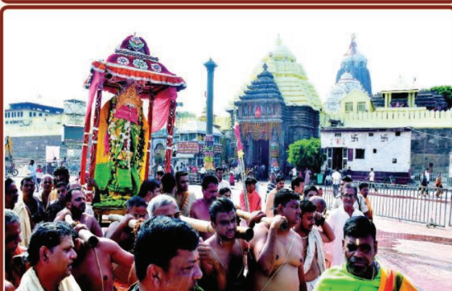
Shree Sudarsahan Mahaprabhu's Ashram Bije' being performed on Dt. 28.10.23 on the eve of Kumara Purnima.