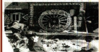
The New Indian Express Dt. 13.10.23

The Darpadalan chariot wheel, in this context, is regarded as a powerful symbol of progress and development, the VC stated, adding, it would serve as a source of strength and motivation for students, inspiring them to advance in both their academic and social lives.