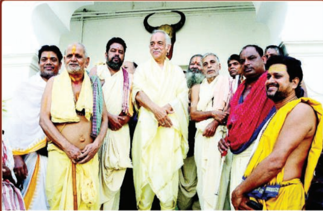
On the occasion of Sahasrakumbhabhiseka Gajapati Maharaja alongwith Bramhins at Shree Nahar on Dt. 6.10.23