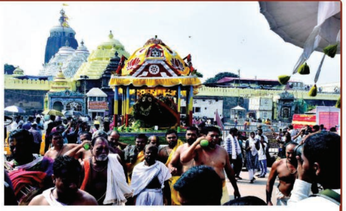
Visit of Shree Durga-Madhab to Maa Narayane Temple at Dolamandap Sahi on Dt. 14.10.23 in the context of 'Sholapuja'.