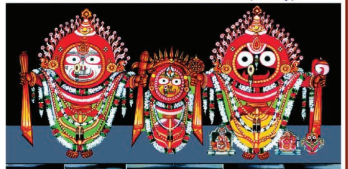
Laxminrusingha Besha Dt. 26.11.23 (Sunday)