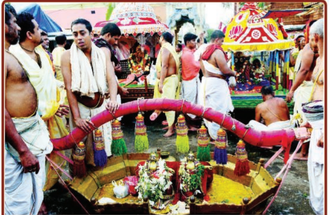
Dashahara Niti being performed with Prabhu Rama-Krushna, Madanmohan & Durgamadhab at Shree Jagannatha Ballabh Math on Dt. 24.10.23