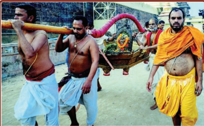
Shree Narayan's Sagar Bije Niti (Visit to Father-In-Law-Mahodadhi) on the New-moon day Dt. 14.10.23